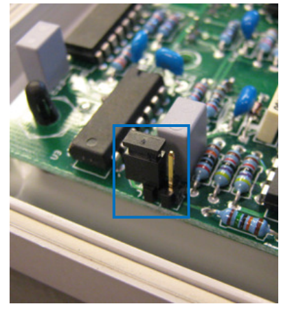
50/60Hz jumper position