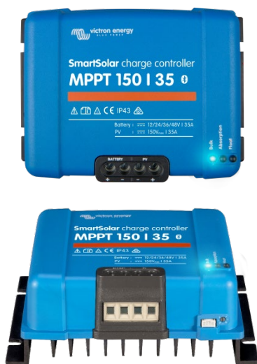
SmartSolar Charge Controller MPPT 150/35